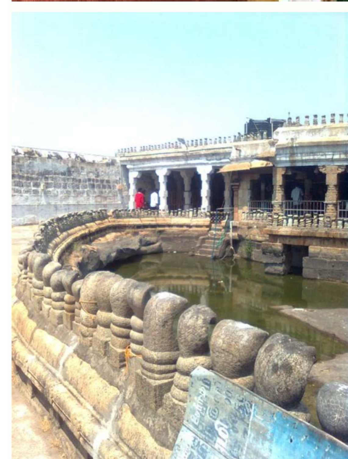
What is bhairavi punya pooja. Bhairavi punya pooja method. How to do bhairavi punya pooja. Linga bhairavi punya pooja cost. How to do linga bhairavi pooja at home.